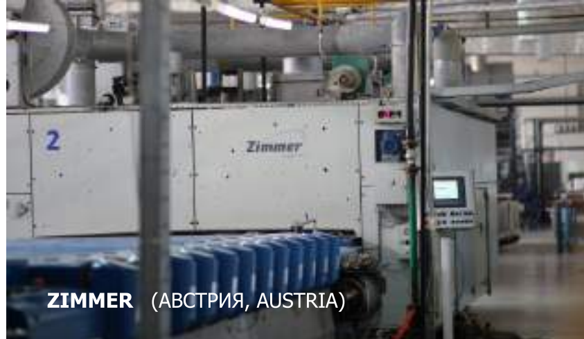
ZIMMER (АВСТРИЯ, AUSTRIA)