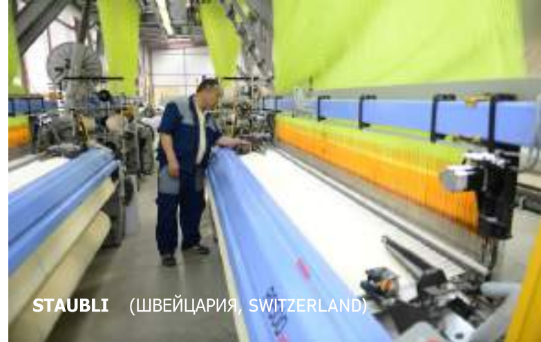
STAUBLI (ШВЕЙЦАРИЯ, SWITZERLAND)