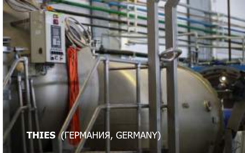
THIES (ГЕРМАНИЯ, GERMANY)