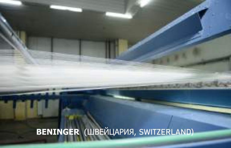
BENINGER (ШВЕЙЦАРИЯ, SWITZERLAND)