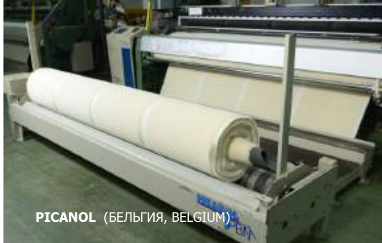
PICANOL (БЕЛЬГИЯ, BELGIUM)