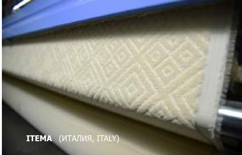
ИТЕМА (ИТАЛИЯ, ITALY)