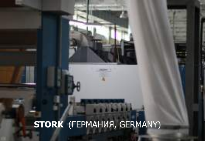
STORK (ГЕРМАНИЯ, GERMANY)