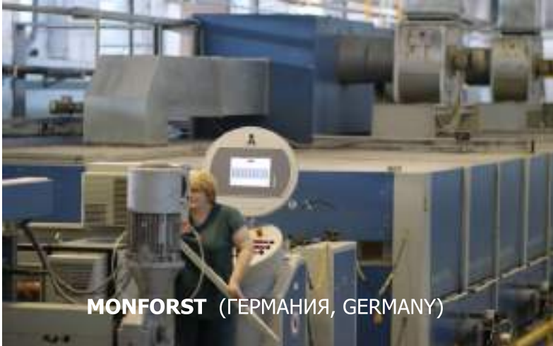
MONFORST (ГЕРМАНИЯ, GERMANY)